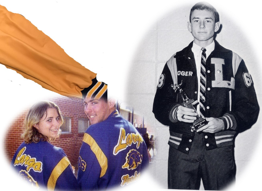
He shows his "H-