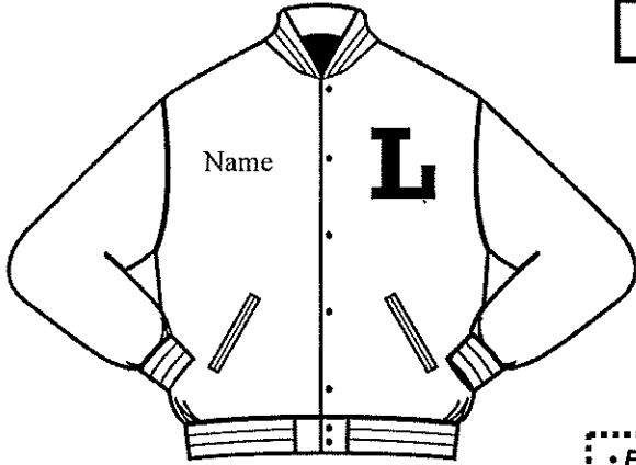
ROYAL WOOL BODY GOLD SLEEVES